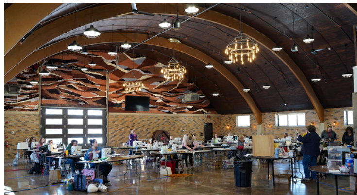
Feb 2023 - A Continuing Ed retreat for twenty-one North Dakota FACS teachers. The spent 15 hours learning about fleece, fiber, and textiles. They booked again for next year!